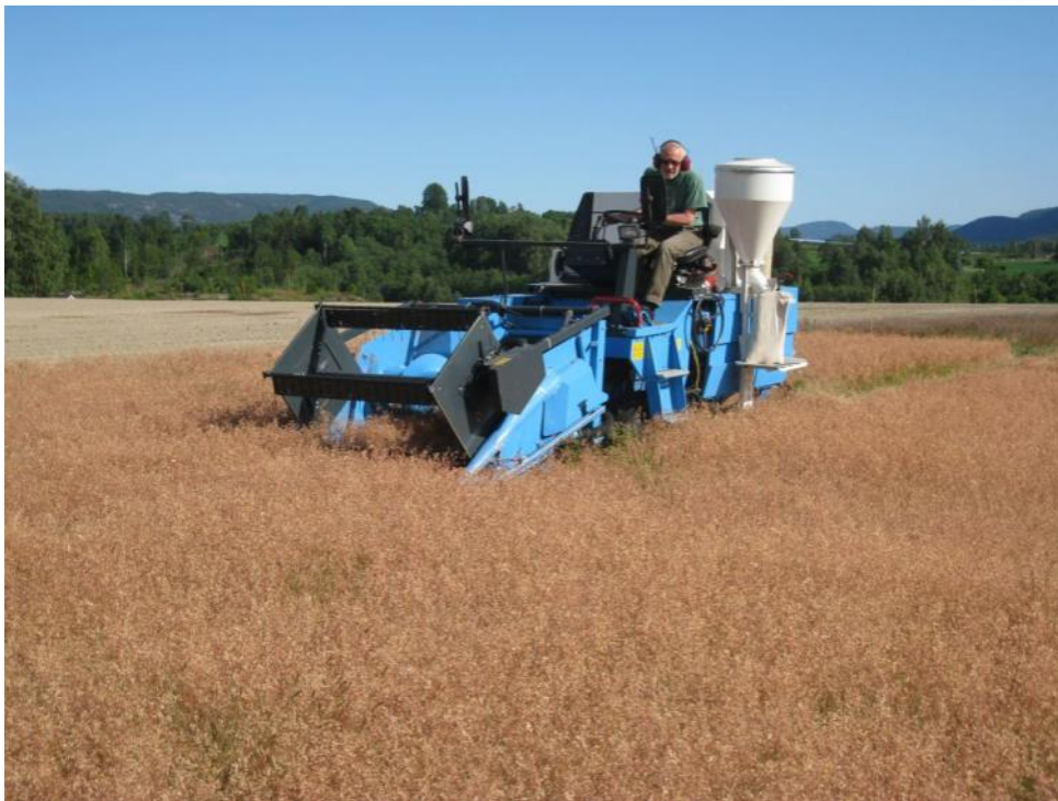
Photo 3. Seed harvest of second generation seed crop of Poa alpina . This crop was only 0.1 ha, but produced more than 100 kg seed.

Of the species that we have in production so far, Festuca ovina and Poa alpina seem to be relatively easy with seed yields sometimes exceeding 1000 kg/ha (photo 3). Phleum alpinum , which we expected to be easy based on our long experience with seed production of forage timothy ( Phleum pratense ), has been our biggest disappointment as it gives seed yields of only 100-120 kg/ha. While the seed yield capacity of Alpine and Arctic populations of F. ovina and P. alpina seem to be unaffected across a wide range of latitudes and altitudes, Phleum alpinum seed crops in lowland areas are often heavily infected by rusts and other diseases and therefore require at least two application of fungicide per year. For some of the species, we may also run into problems with the flower induction requirements as the growing season in the main seed production area in SE Norway starts in mid-April at a much shorter photoperiod than the Arctic and Alpine populations are used to. As northern mountain grasses usually differentiate apices in autumn and develop very rapidly in spring, the most important period for seed harvest is in late June, i.e. one 5-7 weeks earlier than for most other seed crops. For Phleum alpinum we are now starting parallel experiments at various latitudes (58-71°N) and altitudes (0-550 m a.s.l) in Norway to find the optimal location for seed production of populations originating at various sites.