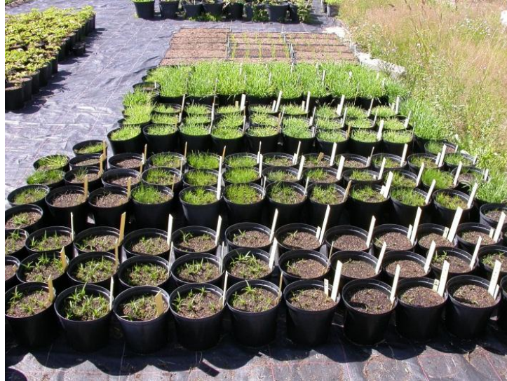
Photo 4. Pot experiment evaluating selectivity of graminicides in Poa alpina , Phleum alpinum , Avenella flexuosa and Luzula frigida .

Most Arctic and Alpine species are very slow in establishment and therefore vulnerable to competition from weeds, especially in the sowing year. So far, all seed crops have been established in a pure stand without cover crop. Most growers plant their seed crops in early June after a chemical spring fallow, and we have conducted a number of pot and field trials to evaluating the selectivity of various graminicides (photo 4). Our biggest problem is Poa annua .