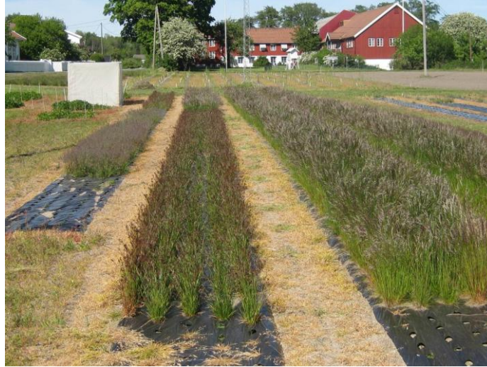
Photo 1. First generation seed multiplication at Bioforsk Landvik. From left to right: Poa alpina , Luzula frigida , Avenella flexuosa .

According to subgoal 2, seed is being multiplied over two generations. First generation crops are established by raising plants in nurseries and transplanting them onto field beds covered by black plastic to avoid weed contamination. Most of these first generation crops are located at Bioforsk Experimental Farm Landvik in SE Norway (58°20'N, 10 m a.s.l.) (photo 1). The areas of these first-generation fields have varied from 12 to 800 m 2 (mean 131 m 2 ) and seed yields from 15 g to 25 kg (mean 2.6 kg).